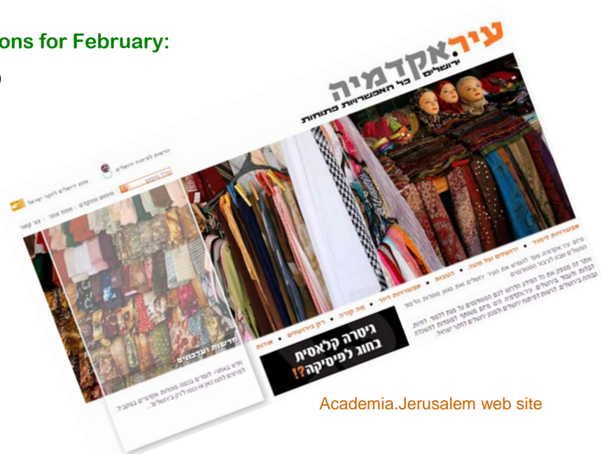
Academia.Jerusalem web site