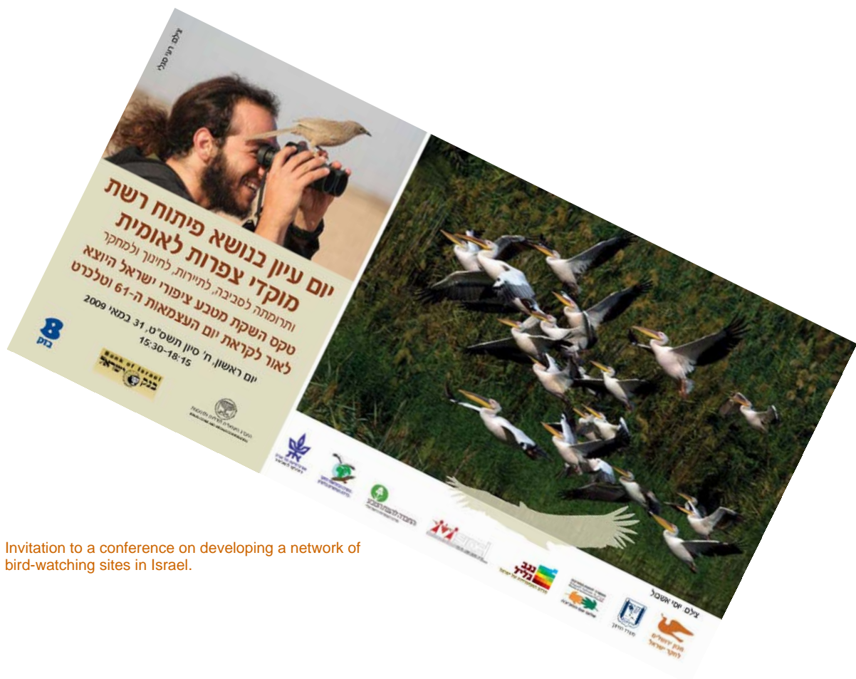
Invitation to a conference on developing a network of bird-watching sites in Israel.