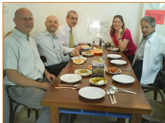
The Audit team with JRIS coordinators