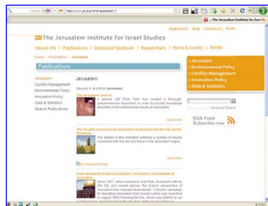
Pages from the new website